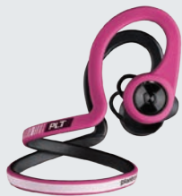
Flexible neckband design