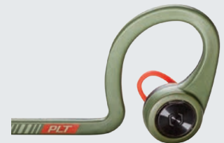
Rich, immersive audio