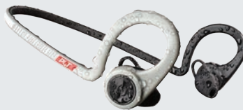
Easy-access on-ear controls