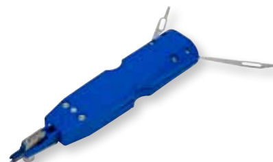
3M™ IDC Termination Tool SOR OC PKSI-S with disconnection hook