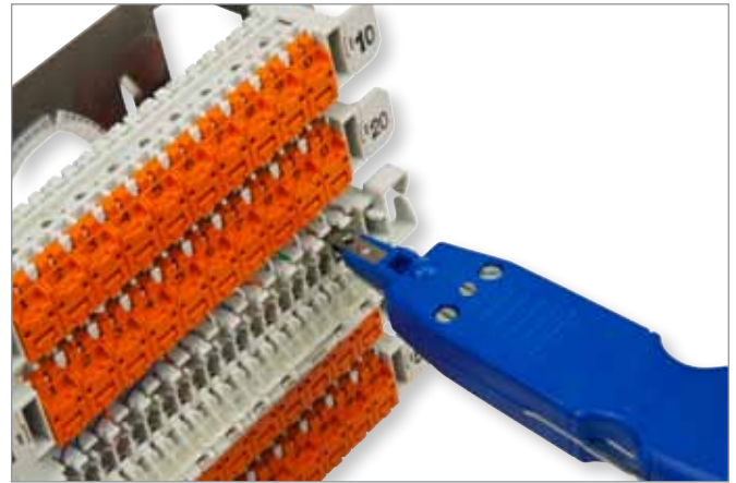
3M™ IDC Termination Tool SOR OC SI-S being used on the 3M™ Quick Connect System (QCS) 2810

3M, Quante and ID3000 are trademarks of 3M Company. All other trademarks herein are the property of their respective owners.