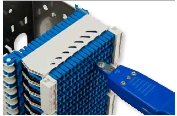
3M™ IDC Termination Tool SOR OC SI-S being used on the 3M™ High Density Block BRCP-HD