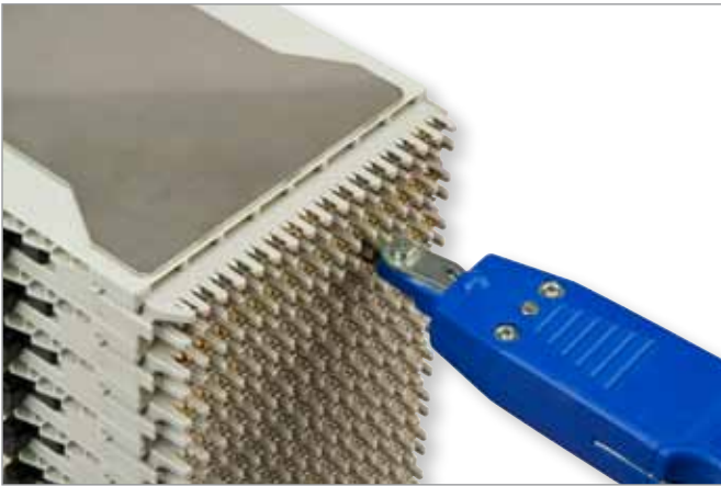
3M™ IDC Termination Tool SOR OC SI-S being used on the 3M™ ID3000™ Terminal Block