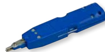
3M™ IDC Termination Tool SOR OC SI-S