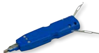
3M™ IDC Termination Tool SOR OC SI-S with disconnection hook