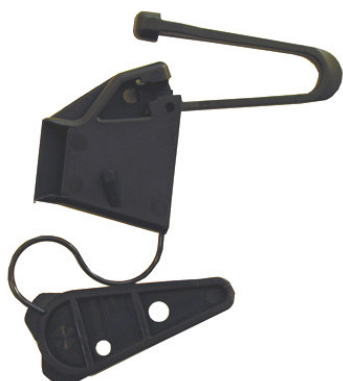
Drop wire clamp 5/35