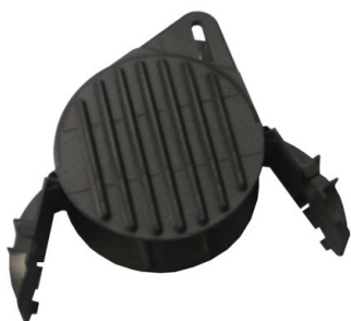
Protection box to be clipped on 5/35