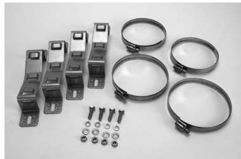
3M™ FDC-HS Pole Mount Bracket