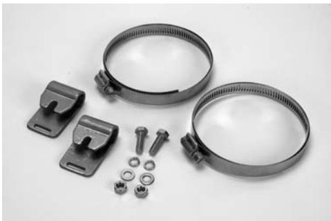
3M™ FDC-HS Aerial Strand Mount Bracket