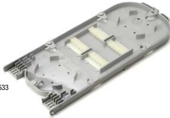
3M™ Splice Tray 2533