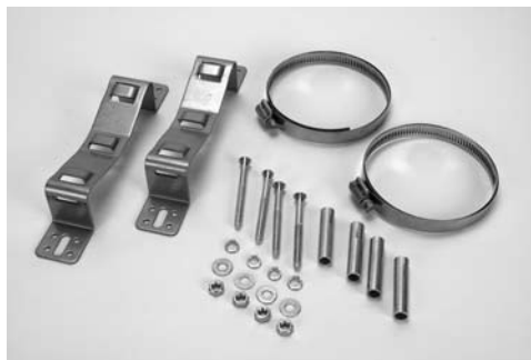
3M™ FDC-HS Wall Mount Bracket