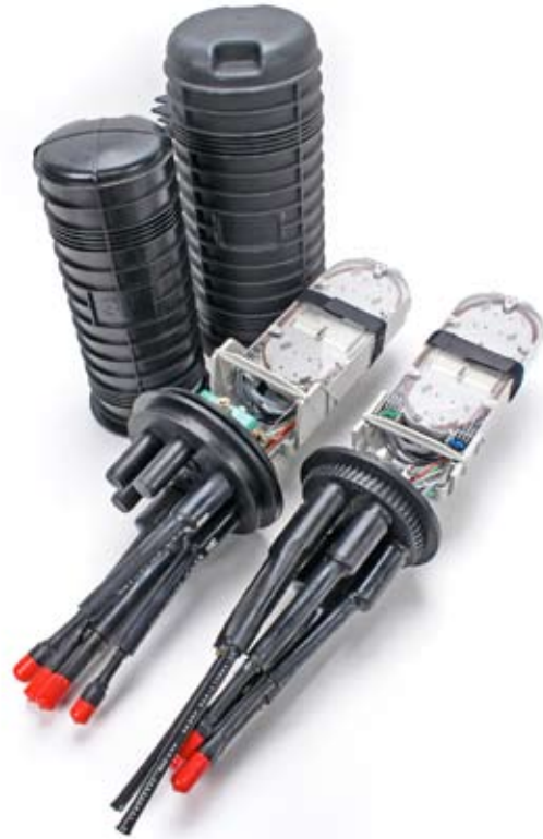
The 3M™ Fiber Dome Closures - Heat Shrink FDC-HS-L5 and FDC-HS-S4

The FDC-HS-L5 closure is equipped with one oval port for express cable applications and five round cable ports. The oval port can accommodate two cables up to 25mm (1.0”) in diameter and the round ports can accommodate cables up to 20mm (0.76”) in diameter. The single fusion splice capacity for the L5 closure is 144 and the mass fusion splice capacity for 4-ribbon, 6-ribbon, 8-ribbon & 12-ribbon fiber is 288, 432, 480 or 720, respectively.