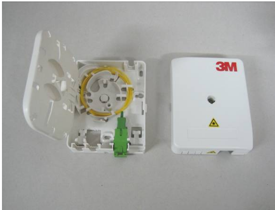
Outlet for FTTH deployments

The 3M™ 10683 FTTH Wall Outlet is an ideal transition point between the incoming fibre cable and the access points in the home for fibre to the home installations. The outlet is designed to accept up to two SC connections (using unflanged adapters with integrated shutters) and is compatible with direct termination of the incoming fibres using 3M™ NPC connectors for. Where pigtail splicing is used, up to two splices (either mechanical or fusion) can be placed in the splice holders integrated into the splice tray. The 10683 FTTH Wall Outlet can also be used as transition box for cables, with up to three cable entries either from the bottom or the top or the rear of the outlet. Cable preparation is done outside the outlet (fixing strain relief elements are included) with a unique cable entry system.